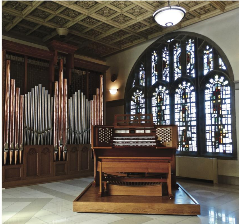
THEOLOGICAL COLLEGE, WASHINGTON, D.C.

is a full-line representative for pipe, digital, and hybrid organ solutions.