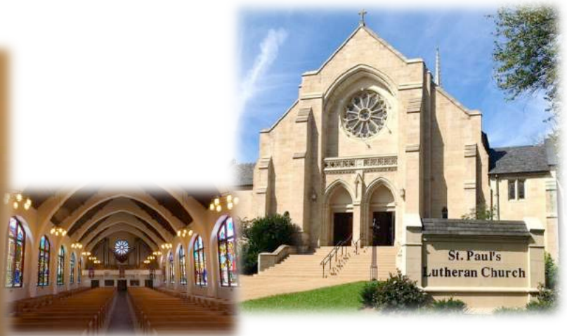
St. Paul's Lutheran Church in DC Site of our Presidents' Day Festival