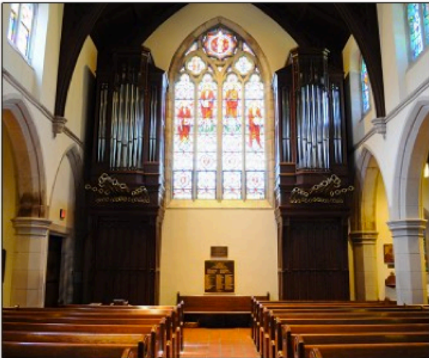
Opus 50 • Good Shepherd Episcopal • Lexington, KY • IV/58

There is safe, free, and ample parking available at the Franciscan Monastery.